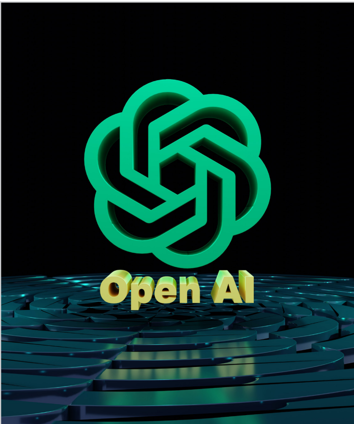
ARTIFICIAL INTELLIGENCE (AI)